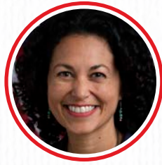
Xochitl Torres Small Deputy Secretary U.S. Department of Agriculture

Helped ensure Hispanic representation in decision-making and leadership roles by successfully championing dozens of appointments to key federal agencies, including historic appointments to the FCC, Federal Reserve, and USDA.