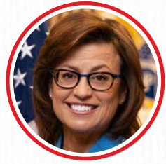
Anna Gomez Commissioner Federal Communications Commission

In addition to speaking at the 60th Anniversary of The March of Washington, our President and CEO Janet Murguía and National Urban League President and CEO Marc Morial were featured in Gumbo Coalition , a documentary about their joint work to fight structural racism amid a resurgence of white supremacy.