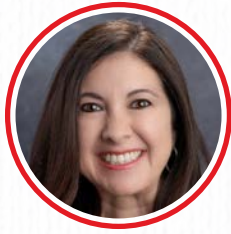
Adriana Kugler Board of Governors Federal Reserve System